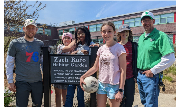
Earth Day - April 22