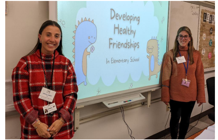
Mental Health Resource Night - April 18