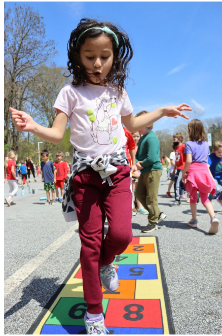
Jump Rope for Heart WES - April 22